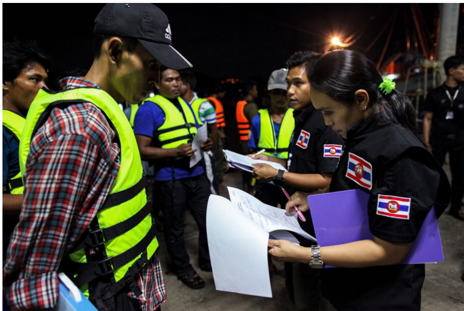
ILO representatives take part in a boat inspection at a Phuket, Thailand, fishing pier in September 2017.

Editor's Note: The following was originally published in the Oct. 7 edition of the Bangkok Post and is published here with the permission of the author and the International Labour Organization ( http://www.ilo.org/global/lang--en/index.htm ).