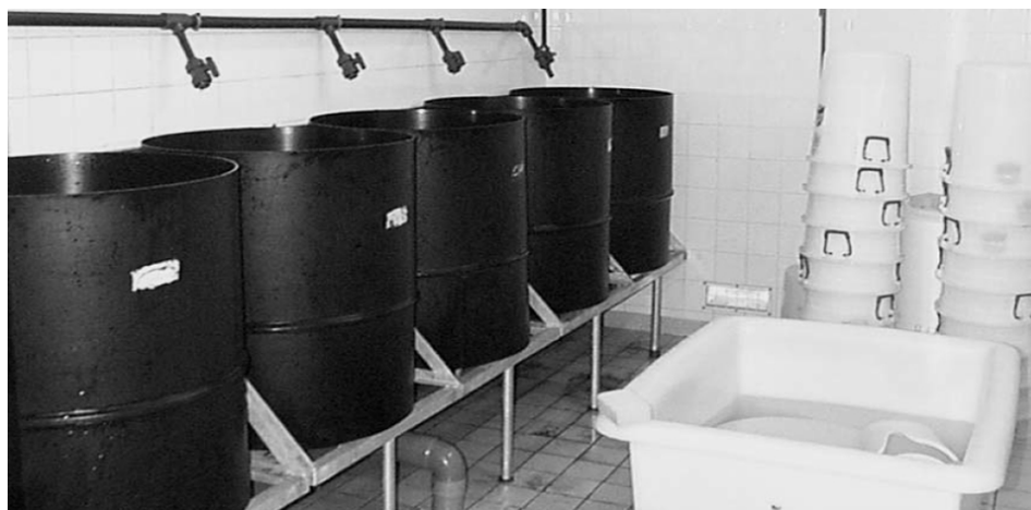
Experimental disease challenge room.

In fact, these domesticated strains could be of great interest for their breeding value and their health status: they could be used by a private foreign breeder to develop improved commercial hybrids. They could also be used as stabilized control lines because inbreeding has reduced drastically their genetic variability.