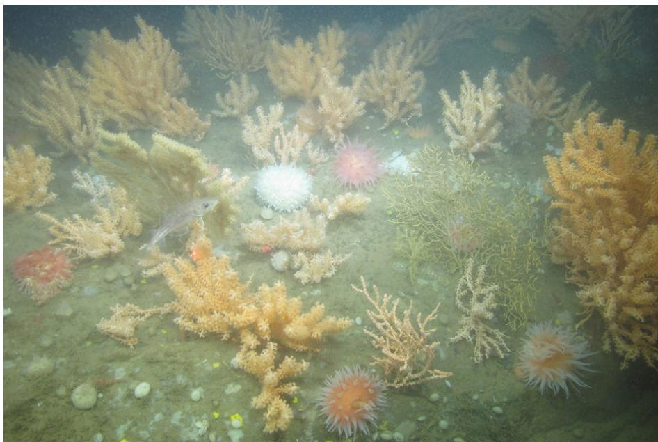
Fish swim among corals in the northern Gulf of Maine.

To preserve corals and sponges in Alaska, with its highly productive fisheries, in 2006 large offshore areas were protected from bottom trawling to “limit expansion of fisheries into previously unimpacted habitats and protect essential fish habitat for fisheries species,” says Hourigan. NOAA Fisheries and fishermen have modified a Bering Sea flatfish trawl that’s raised off the bottom to reduce impacts on seafloor animals while still herding flatfish, which solves at least one of many impacts here on corals and sponges.