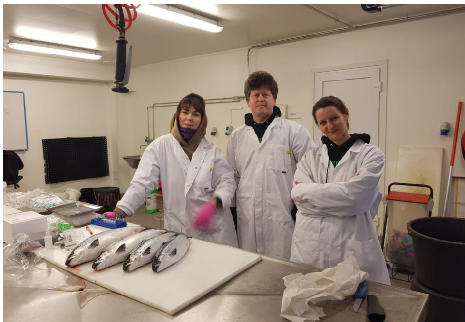
The Fish Farm Solutions team validated their work at LetSea in Norway.

Norway, the world's largest farmed salmon producer, boasts an advanced, consolidated industry that benefits from strong government regulation, academic support and investment capital. Despite these technological and economic advantages, a range of infectious diseases remain troublesome.