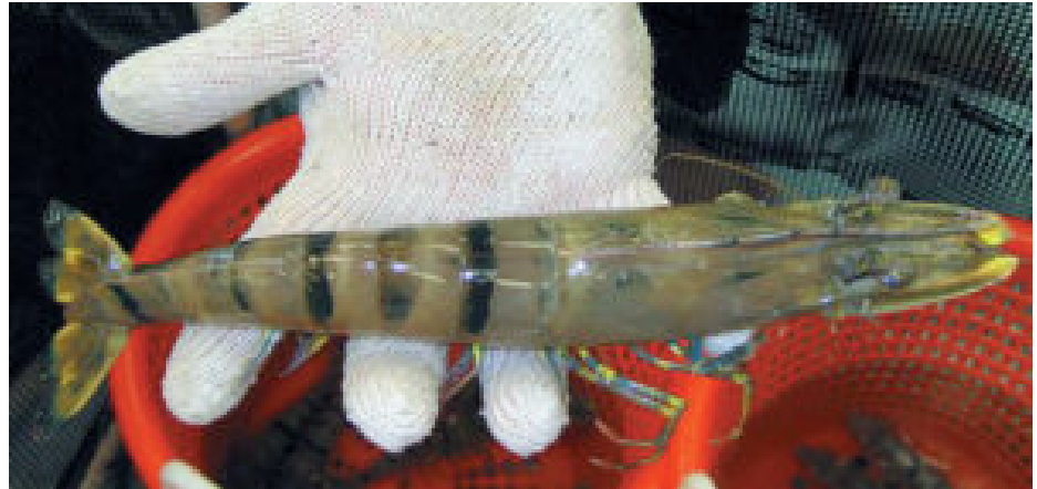
Adult breeders are held at a nucleus breeding center in Kona, Hawaii.

A diagnostic laboratory was included in the quarantine facility to facilitate rapid availability of results for polymerase chain reaction (PCR), microbiology and histology diagnostic testing. To insure that only specific pathogen-free (SPF) F 1 shrimp were transferred out of the primary quarantine facility, each imported breeder and the resultant F 1 family were sampled and tested by PCR and histology.