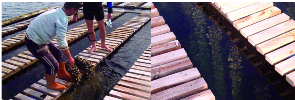
In Izmir, clusters of mussels cling to lines suspended from rafts.