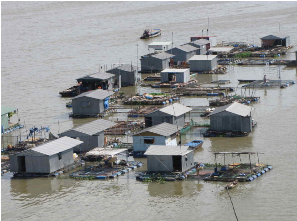
Houseboat rafts with cages under for rearing fish near Mỹ Tho, Vietnam.

The Global Aquaculture Alliance’s annual production survey for key finfish species was presented at the GOAL 2019 conference in Chennai, India in late October. The estimates are based on a global survey of many informants undertaken by GAA, with additional estimates derived from Kontali Analyse AS.