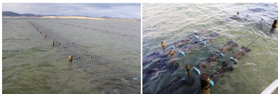
Oyster culture farm in Tasmania, Australia.

Our study focused on coastal and open water farming systems only. Based on the predicted HSI, we calculated the total area of the world's exclusive economic zones (EEZ) that is suitable for farming marine species. We examined the variation among models and compare it with the mean predictions across models to highlight where predictions were most robust to variations. We then evaluated model projection uncertainties and estimated the total area that would be suitable for mariculture. Finally, we discussed the implications of our results for future mariculture development.