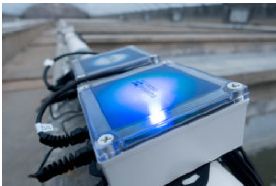
The newest iteration of the Osmobot.

Editor’s note: This is the first of three articles profiling this year’s finalists for the Global Aquaculture Innovation Award, sponsored by Skretting. Look for the second and third finalist profiles in the next two weeks.