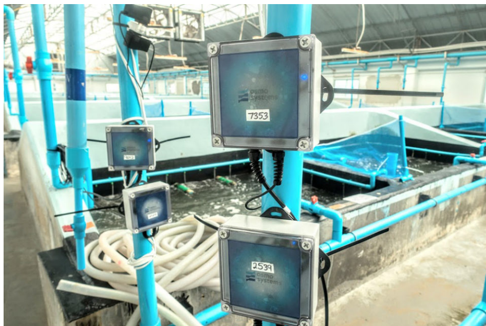
Prototype Osmobot system in place in an indoor RAS facility.

Fish farmers are, if nothing else, sticklers for tradition.