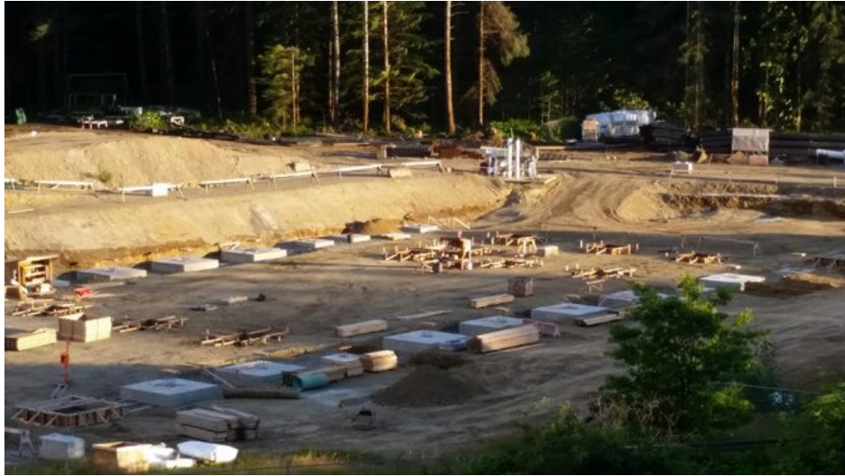
New RAS facility under construction at existing smolt hatchery in British Columbia Canada.

It is also relevant to mention that fish farms are contending with increasingly stringent pollution discharge regulations and diseases in open systems, whether these are open flow-through systems or floating tank systems. In contrast, closed containment RAS operations provide a controlled environment for fish production that, when managed properly by proficient operators, can reduce or eliminate many of these constraints.