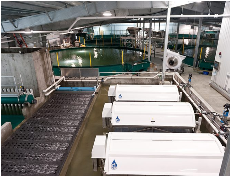
View of the water treatment area of Kuterra LLC, a commercial RAS facility near Port McNeill, BC, Canada. Note the array of 500-cubic-meter culture tanks in the background, and the fish pump and mobile grader station.

Practical, effective training is critical and often hard to come by for owners, operators and even designers of large land-based closed-containment facilities that use water recirculating aquaculture systems (RAS). In fact, as large salmon farming companies are now investing heavily into increased RAS production of smolts and post-smolts across northern Europe and North America, there is arguably a shortage of trained farm operators and managers to run these systems.