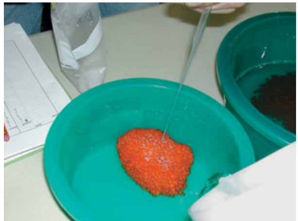
Artificial fertilization of trout eggs.

In limited cases, the relationships among a subset of these traits are known. For example, the genetic relationship between growth and resistance to viral hemorrhagic septicemia (VHS) in one farmed population of rainbow trout, Oncorhynchus mykiss , was shown to be negative. This unfortunately suggested that simply selecting for improvement in growth would result in lowered resistance to VHS.