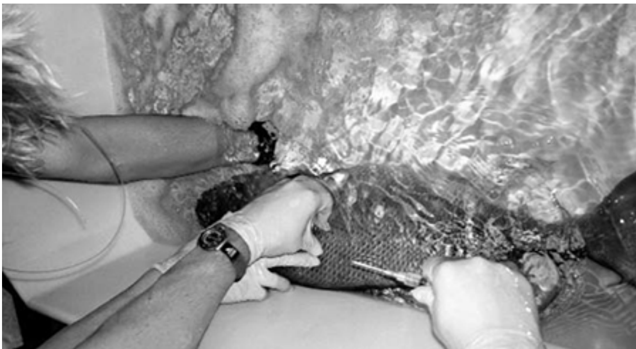
An anesthetized mutton snapper is injected with antibiotics as part of a prophylactic treatment.