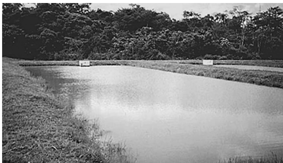
Fig. 1: Each of Pará's four larger farms have 10 to 15 ha of pond area.

Grow-out pond area is currently about 60 ha, with an estimated production of around 70 metric tons (MT). There are four larger farms with 10 to 15 ha of ponds each (Fig. 1). The rest of the farms have less than 1 ha of pond area (Fig. 2).