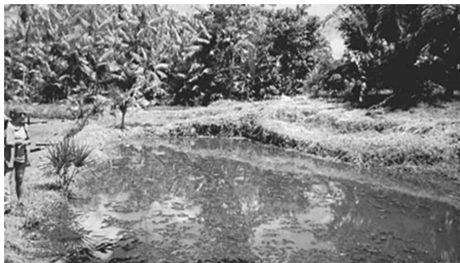
Fig. 2: Smaller producers in Pará maintain ponds of about .05 ha.

The production chain for freshwater prawn culture in Amazonia has many weak elements, as is the case with almost all other aquaculture sectors in Brazil. The main development constraints are the lack of technology-transfer programs and technical assistance, an irregular postlarvae distribution schedule, scarcity of manufactured aquaculture feeds and ingredients for on-farm aquafeed preparation, limited supply of ice, and difficulties in obtaining credit from financial institutions.