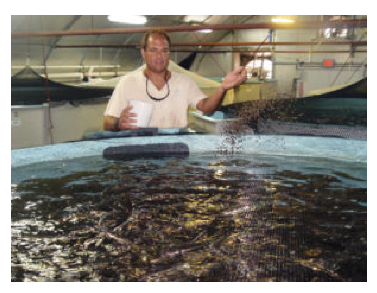
Hand feeding allows farmers to closely observe feeding activity and changes in behavior.

consideration in feeding management is proper storage of feed. Feed should be stored in a cool, dry place, as damp feed degrades and molds quickly. Moldy feed is toxic to fish and should be discarded immediately. Store feeds where conditions do not exceed 22 degrees-C temperature or 75 percent humidity.