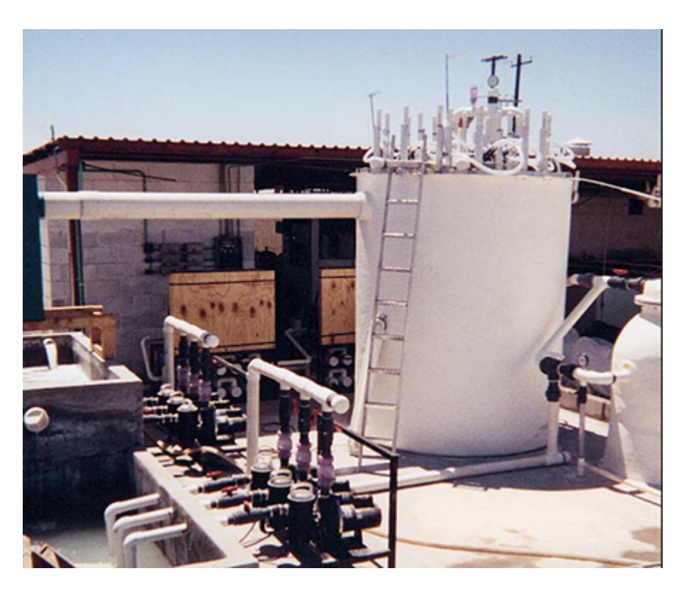
Complete fluidized bed filter system for shrimp maturation.

Recirculating systems also need to be managed carefully for optimum performance. This will require regular backwashing of filters and routine checking of sand and sump tank levels. Acomplete maintenance log must be kept up to date. Regular testing of ammonia, nitrite, and pH is also required. In commercial hatcheries, a dedicated, water quality manager may be needed to keep careful records and make important system management decisions.