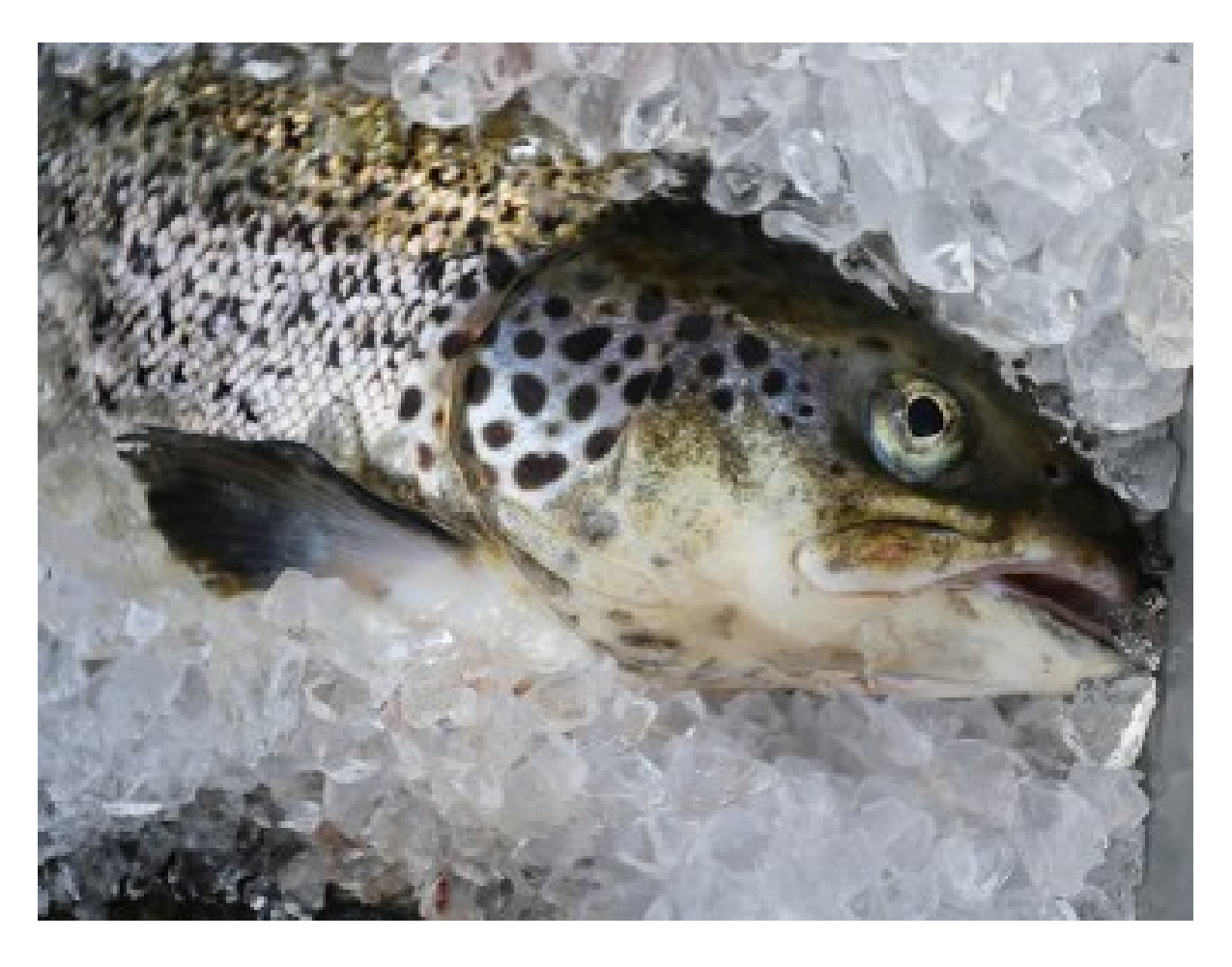
Freshwater Institute's Atlantic salmon in ice on the way to processing.