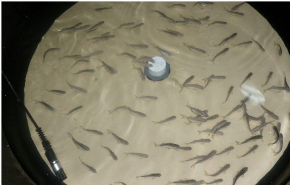
View of pompano juveniles in an experimental tank.

Regarding their fatty acid profile, all tissues analyzed were affected by dietary treatments, and generally imitated dietary fatty acid composition, which is highly consistent with the pertinent literature on fish oil sparing. All experimental diets tested produced fillets with reduced levels of beneficial omega-3 fatty acids and LC-PUFAs vs. the FISH control group. None of the diets produced the same fillet levels of omega-3 fatty acids or omega-3:omega-6 fatty acid ratio as the FISH control feed.