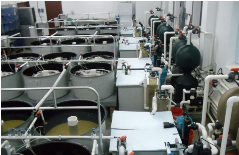
View of the experimental setup, with fish tanks and life-support systems.

For many years there has been interest in developing commercial culture of the Florida pompano ( Trachinotus carolinus ) a good candidate for intensive aquaculture. Its nutritional requirements have been studied for many years, but there are few published studies addressing lipid nutrition of Trachinotus spp. Although without definitive evidence, we assumed that Florida pompano – like other marine, carnivorous fish species – exhibit little to no capacity for LC-PUFA synthesis and must consume these critical nutrients directly. Recent findings suggest that LC-PUFA requirements may be satisfied more efficiently in the context of SFA- or MUFA-rich diets than C18 PUFA-rich diets. Consequently, we carried out a study to evaluate production performance and tissue composition of juvenile Florida pompano fed diets containing fish oil or 25:75 blends of fish oil and various other lipid sources. This article is adapted and summarized from Aquaculture 458(2016): 177–186.