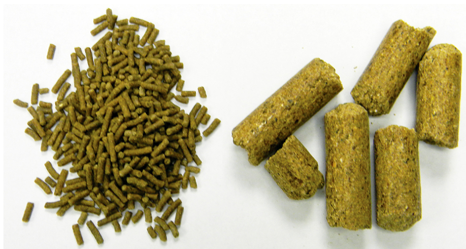
Pelleted feed formulated for freshwater prawns (left) and range cubes.