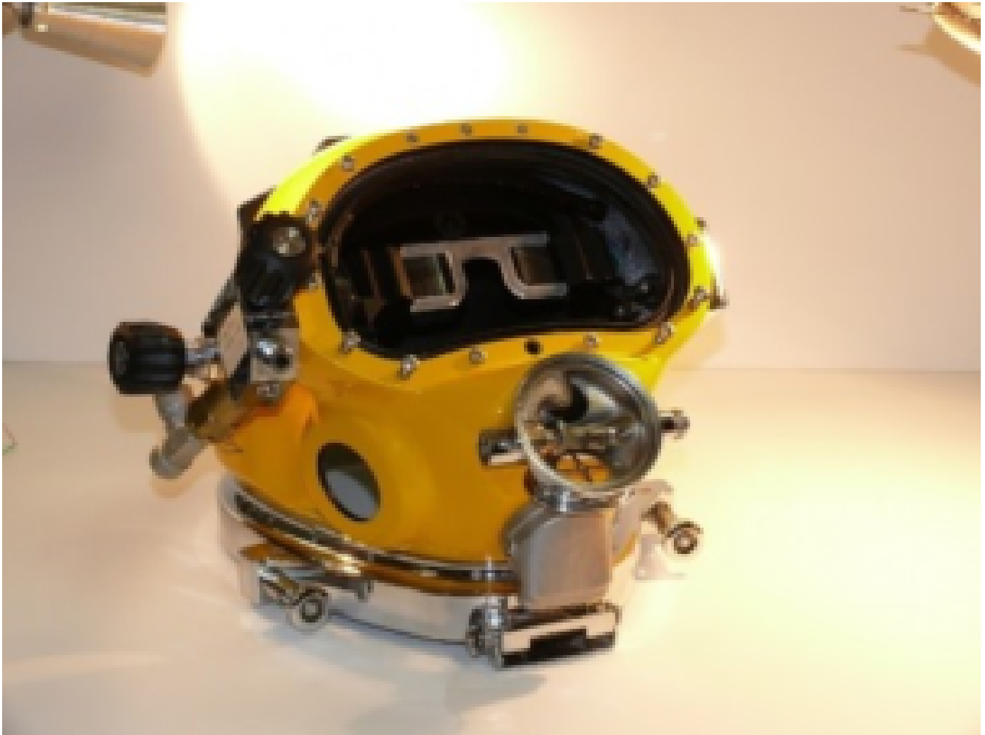
The U.S. Navy developed this diver's helmet that uses augmented reality.

There is great potential for the use of AR in the aquaculture industry. Already the U.S. Navy uses DAVID (Divers Augmented Vision Display), which superimposes high-resolution sonar imagery on a diver's visual world. NASA has tested Microsoft's HoloLens in a similar way. Comparable masks include Scubus S by Indiegogo, which has a camera, or Smart Swimming Goggles by Yanko Design, which even allows for calls between divers. The implications for this from an aquaculture industry standpoint are significant. Producers could use this technology to improve the efficiency of operations, analyze mortalities, health status and a variety of environmental parameters.