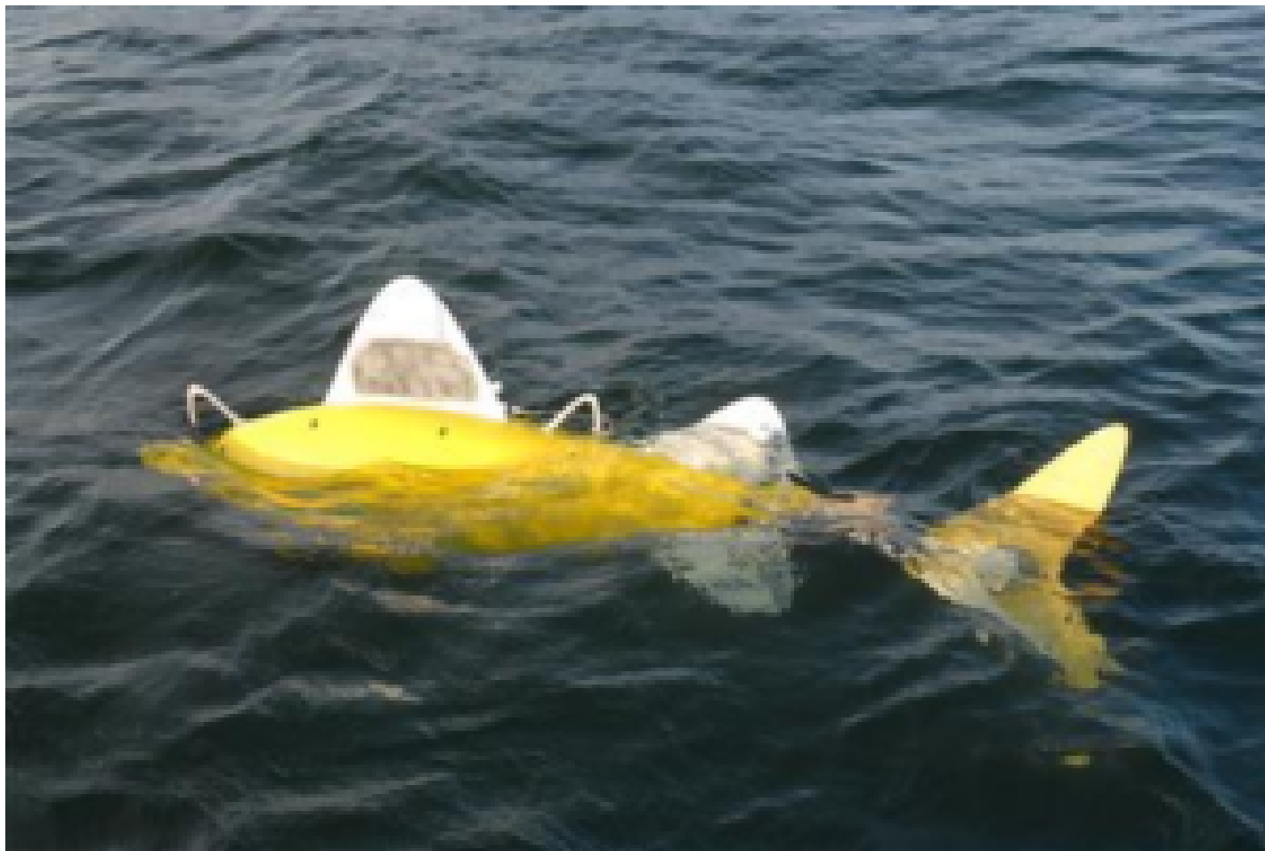
Shoal's robotic fishes work collectively using AI to locate sources of pollution underwater.

Collecting most of their information from sensors, many aquaculture technology companies are harnessing the power of artificial intelligence (AI) to improve decision-making. The Yield, an Australian company that provides technologies for all types of agriculture, uses its Sensing+Aqua technology to create predictive analytics for enhanced data-driven decision-making.