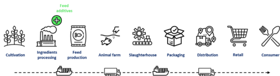
Fig. 1: Life cycle stages in the feed additive industry (designed using www.flaticon.com ).

Successful application of health-promoting feed additives can make a tangible impact on disease prevention by demonstrating activity against the causative agents but also by boosting the health status of cultured organisms. Preventive health strategies can reduce mortality and increase performance since diseases are among the most important factors that hamper productivity in aquaculture by causing significant loss of biomass. Additionally, when disease management is based on treatment instead of prevention, the environmental footprint is exacerbated as well due to the use of chemicals and antibiotics. Health-promoting feed additives are an essential component of a disease prevention scheme, not only by decreasing mortality but also by contributing to the sustainability of the production.