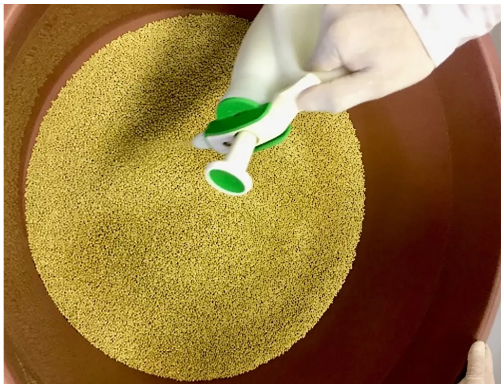
View of the extruded diet used, and application of the liquid enzyme.

Four diets were formulated with 314.4 grams/kg of crude protein 18.8 MJ/kg of gross energy), containing two main sources of energy (corn or wheat bran) supplemented at two levels of xylanase and \beta -glucanase blend (non-supplemented or 0.2 grams/kg) from a commercial supplier (Natugrain® TS, BASF Corporation, Germany). The liquid blend of XB was hand sprayed on extruded pellets and the enzymes' activities were confirmed by laboratory analysis. At the end of the experimental trial, all fish were individually weighed.