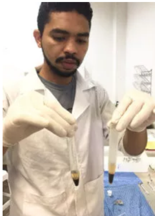
Plasma collection for blood analysis.

No interactions ( P < 0.001 ) were determined between diet type and XB supplementation on protein efficiency ratio, hepatosomatic index, visceral fat ratio, whole-body moisture, crude protein and crude lipids, blood glucose, cholesterol and triglycerides responses of fish, and they were not affected ( P > 0.05 ) by dietary energy source. However, fish fed the diet supplemented with XB showed improved ( P < 0.001 ) values of these variables compared to fish fed diet non-supplemented with XB diet. Feed intake, whole-body moisture, crude protein and ash content, and blood parameters of total protein, aspartate aminotransferase, alanine aminotransferase, and alkaline phosphatase did not differ ( P > 0.05 ) among treatment groups. There was an interaction ( P < 0.001 ) between diet type and XB on whole-body mineral retention. In this context, fish fed wheat-based diets containing XB had higher whole-body ash contents.