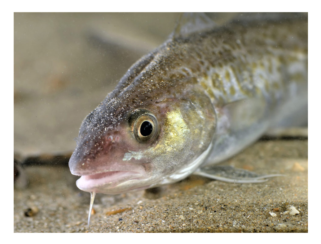
Results of this study to evaluate the effect of alternate-day feeding compared with daily feeding in Atlantic cod demonstrated that feeding costs can be drastically reduced while maintaining or improving fish performance.

The Atlantic cod (Gadus morhua) has been a promising candidate for marine aguaculture in Norway. The commercial culture production of cod increased rapidly for several years (1990 to 2000), but biological (low growth rates, early maturation in captivity, poor disease control) and economical (high production costs, increased wild catches putting pressure on prices) factors resulted in the downfall of the industry. The number of farmers was reduced from 2005 onwards, and most of the industry was closed down.