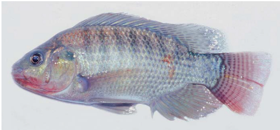
Nile tilapia with bacterial hemorrhagic septicaemia, infected with Streptococcus sp.

Very serious problems associated with the presence of mycobacteriosis have been reported in tilapia in some African countries. To date, however, this infection has only been detected in tilapia cultured in two countries of the Central American and region. In one of these instances, Mycobacterium fortuitum was isolated. Mycobacterium chelonae , M. fortuitum and M. marinum are recognized as potential human pathogens and could be transmitted through the inadequate handling of infected tilapia and/or other infected species of fish (Frerichs, 1993).