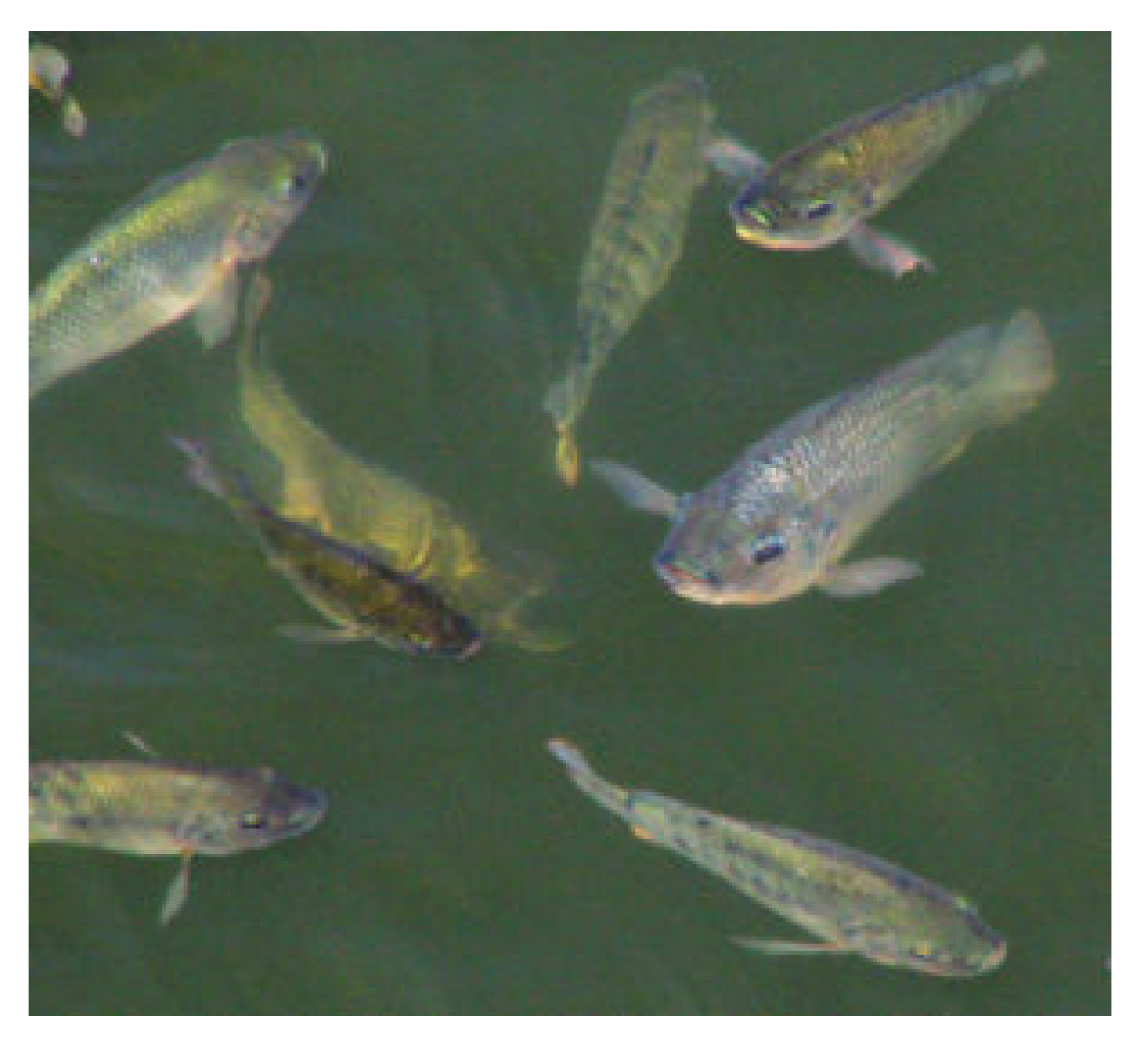
Tilapia fed a diet supplemented with potassium diformate over 74 days had greater growth than fish fed a control diet without the compound.

dietary citric acid, formic acid and their respective salts. In further study by the authors, the effects of supplementation of formic acid in the form of its potassium double-salt on the production parameters of Nile tilapia ( Oreochromis niloticus ) were determined.