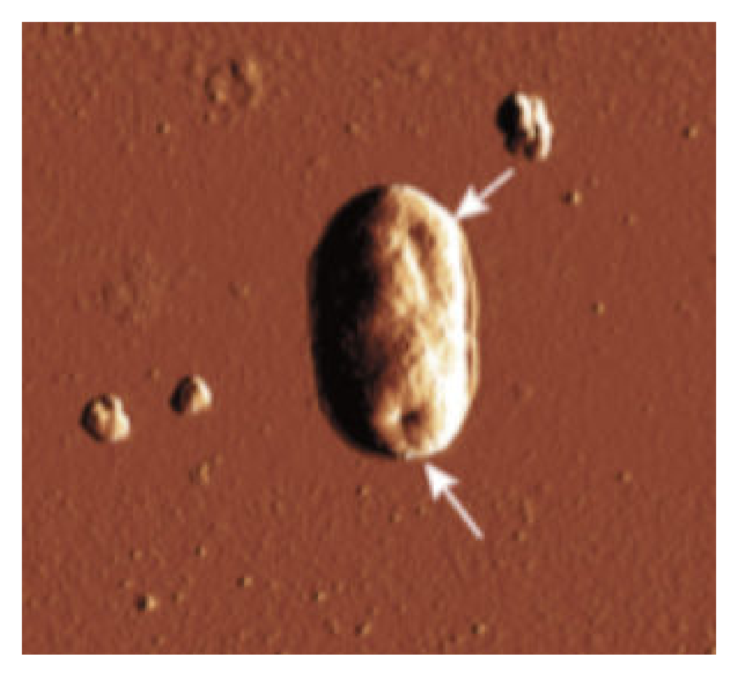
This image from an electron microscope shows the membrane alteration caused by 1-monoglycerides, which disturbed homeostasis and led to the death of the E. coli bacteria cell.