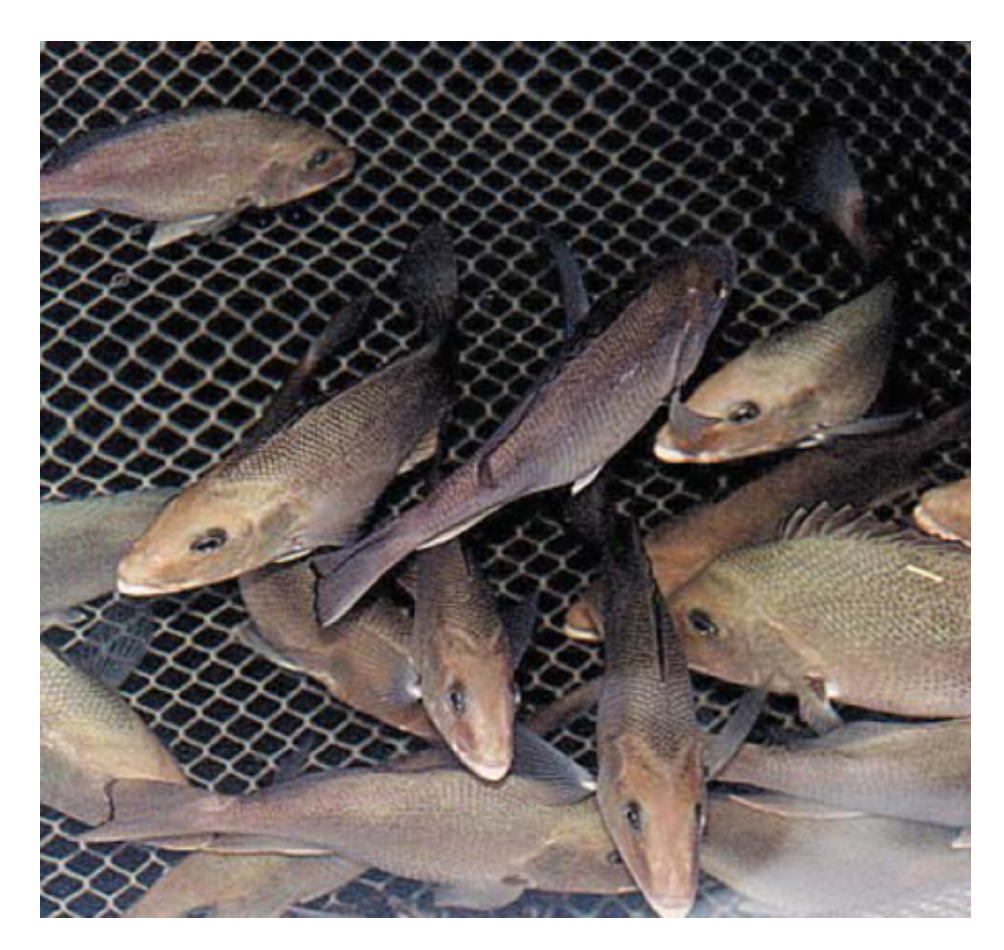
Juvenile red snappers do not bear the adults' characteristic red color.

400 liters of water, but still stocked with 10,000 larvae. The water volume is increased after day 12 to the full 1,000 liters. Therefore, initial stocking in the 200-liter tanks is 10 per liter, while initial stocking for the 1,000-liter tanks is 25 per liter with a final density of per liter.