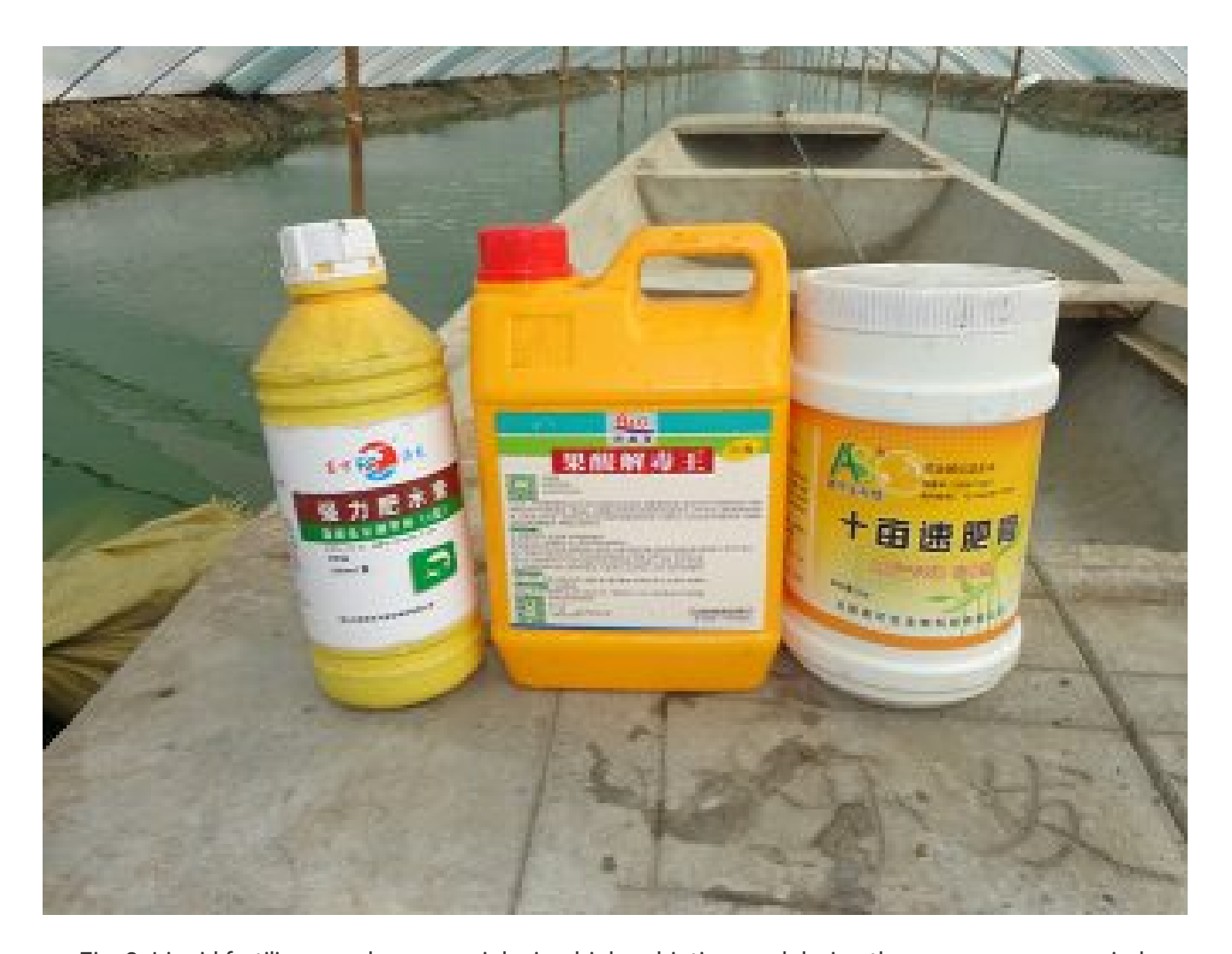
Fig. 3. Liquid fertilizers and commercial microbial probiotics used during the prawn nursery period.