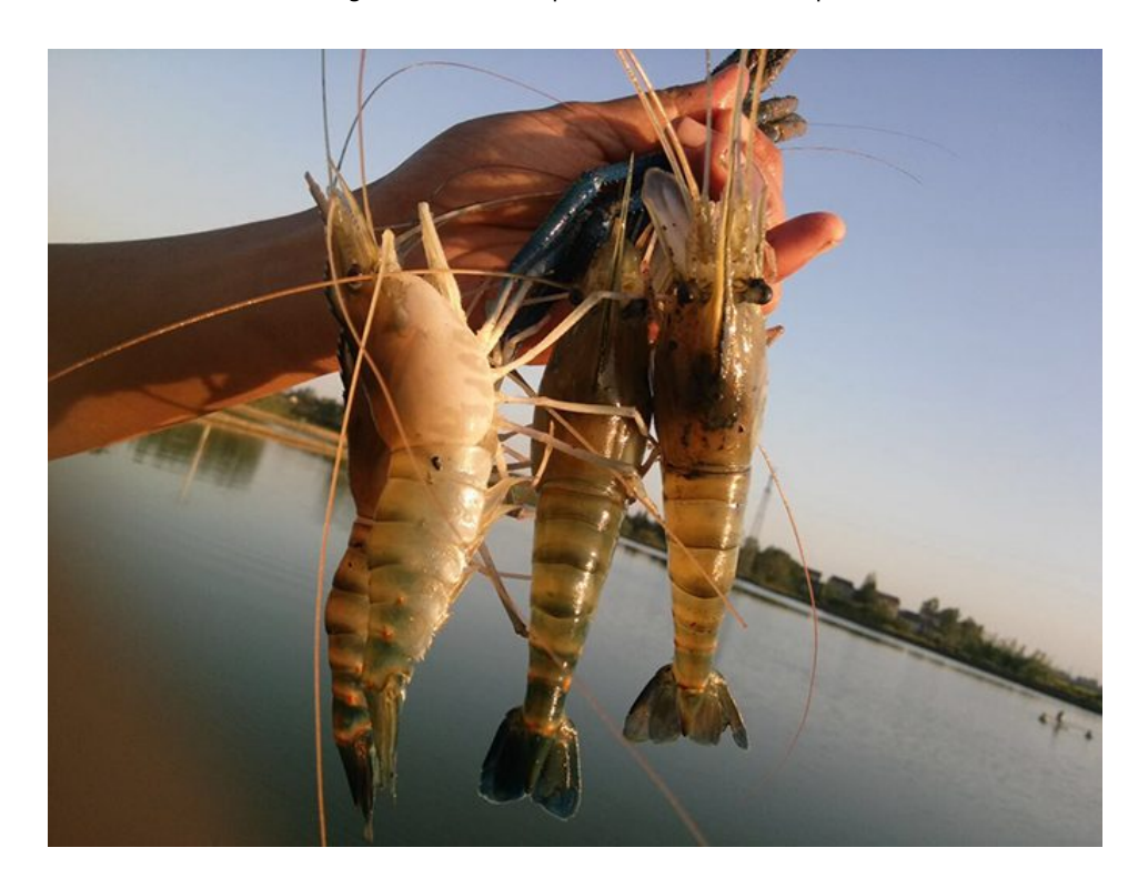
Cultured freshwater prawns are very popular and prominent in China.

The giant freshwater prawn (Macrobrachium rosenbergii) is one of the most commercially cultured crustaceans in the world. It has been grown in China for nearly 40 years, since it was first introduced from Japan in 1976. Freshwater prawn farming is very popular in many regions in China, especially in the Yangtze River Delta region – the most important giant freshwater prawn farming areas – as many local farmers regard the farming of these crustaceans as a good way of making money. The Yangtze River Delta region produced 85,195 tons of M. rosenbergii in 2014, and contributes more than 60 percent of the national giant freshwater prawn production. The economic input from prawn farming is important to local farmers for their livelihoods and income.