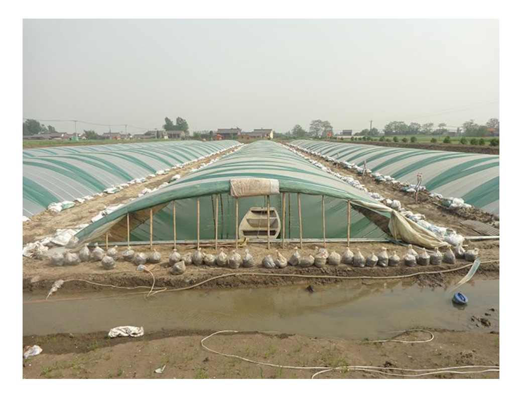
Fig. 2. Common greenhouse used as a nursery pond in Yangtze River Delta.

Water heating is done using simple, coal-fired boiler and a heating distribution system with pipes. The water temperature is generally heated above 26 degrees-C for the duration of the nursery period, and typically lasts until late May. Water aeration is done using air compressors and diffusing equipment, with air stones or micro-bubble generators and air distributing hoses. Dissolved oxygen levels are generally maintained above 5 ppm.