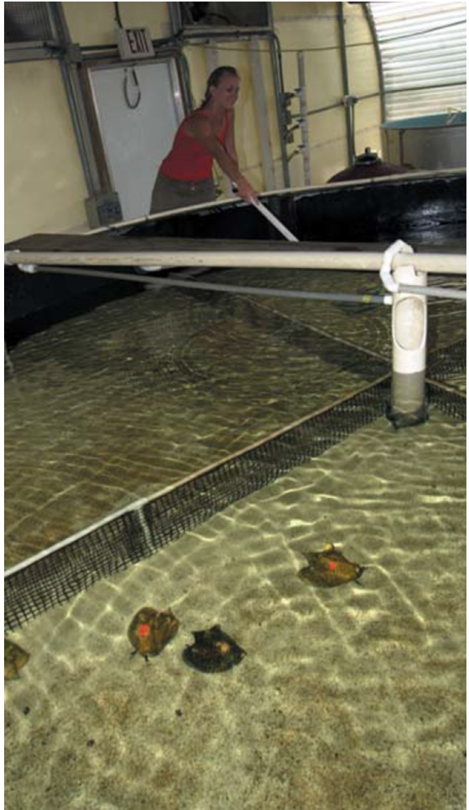
Conch are placed in large circular tanks for breeding.