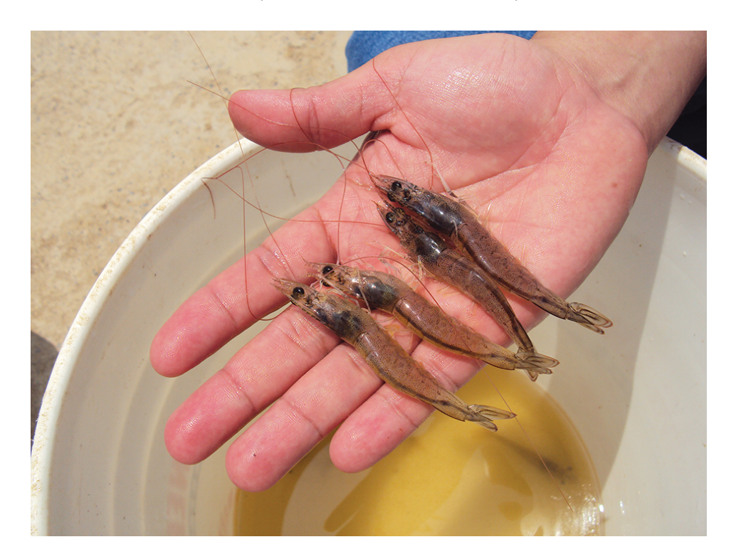
Farm trials require a significant commitment of resources, but can yield valuable data that lead to higher profits.

Continuous improvement – or "kaizen," as it is referenced by the Japanese – is a critical strategy required for the success and sustainability of any business, including shrimp farming. Faced with changing ingredient costs and availability, feed manufactures must adjust formulations on an ongoing basis. Accordingly, facing high feed costs, those farms that regularly conduct experimental field trials to identify the most profitable feeds and optimize feeding programs are often the most successful.