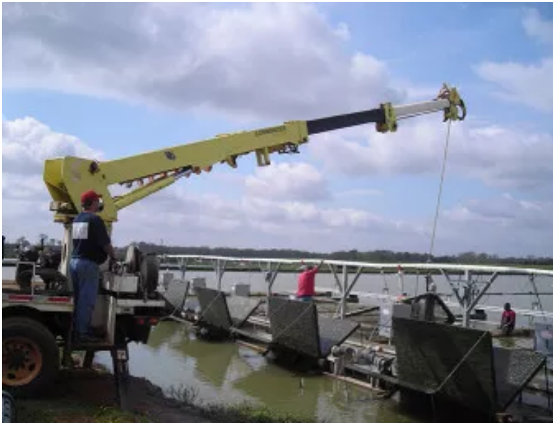
Partial harvest of an in-pond raceway in Browns, Alabama.