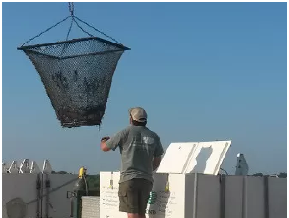
Hybrid catfish being loaded out for stocking of private ponds and lakes.

In-pond raceway systems are considered intensive production, allowing for both large and small scale marketing of catfish. Large scale marketing in west Alabama typically involves selling catfish to processing plants in large quantities on a year round basis. Fish within individual raceway cells can be harvested on a weekly basis and sold to niche markets. This has often enabled the producer to obtain a higher price compared to the processing plant.