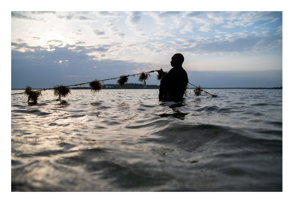
NGO-academic collaborative study finds that mariculture "done right" can aid climate change mitigation by cutting greenhouse gas emissions.

With aquatic foods offering nutritional benefits and a lighter environmental footprint compared to terrestrial agriculture, mariculture - the farming of marine species in ocean and coastal environments is gaining attention for climate change mitigation potential and protein production.