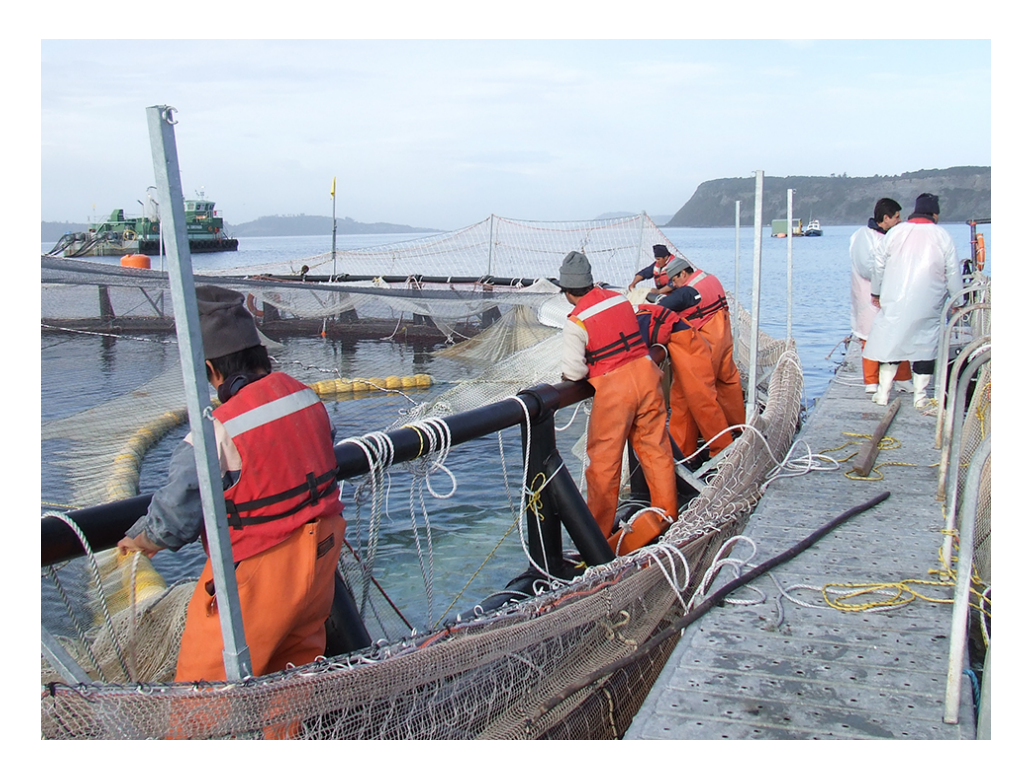
In combination with new regulations, salmon farmers' modified production practices are helping Chile's aquaculture industry recover.