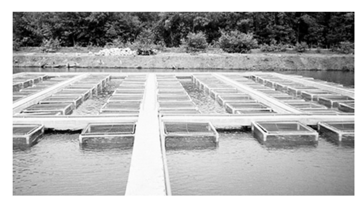
Fig. 1: The growth trial was conducted using bottomless cages in a single 0.32-ha pond.