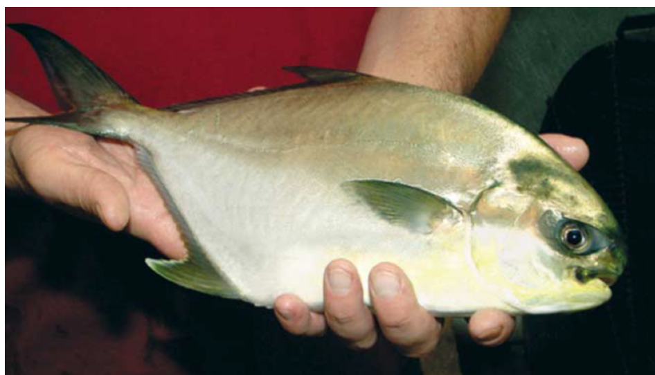
Florida pompano ( Trachinotus carolinus ).

Considered one of the finest marine table fish, the Florida pompano ( Trachinotus carolinus ) commands a significantly higher price than many other United States marine and fresh water finfish species. In 2003, the average wholesale price for whole pompano was $7.50 per kilogram, and depending on the time of year and availability, pompano fillets can fetch $35 per kilogram.