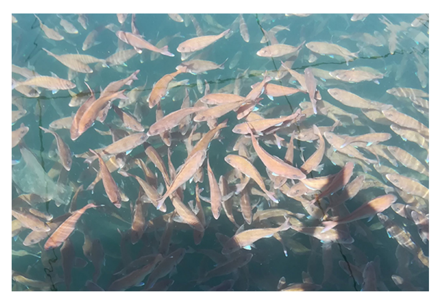
Umitron recently assessed the carbon footprint of red sea bream in Japan by measuring greenhouse gas emissions across the value chain.

Leo and her team found that the procurement of raw materials accounted for more than 80 percent of their operational carbon footprint, with most GHG emissions related to feed production and its transportation to farmers. Feed currently accounts for the largest component of a farm's operational costs, said Leo, and the fact that it makes up the most significant contribution to GHG emissions means that a more concerted effort is required to reduce unnecessary feed waste as much as possible.