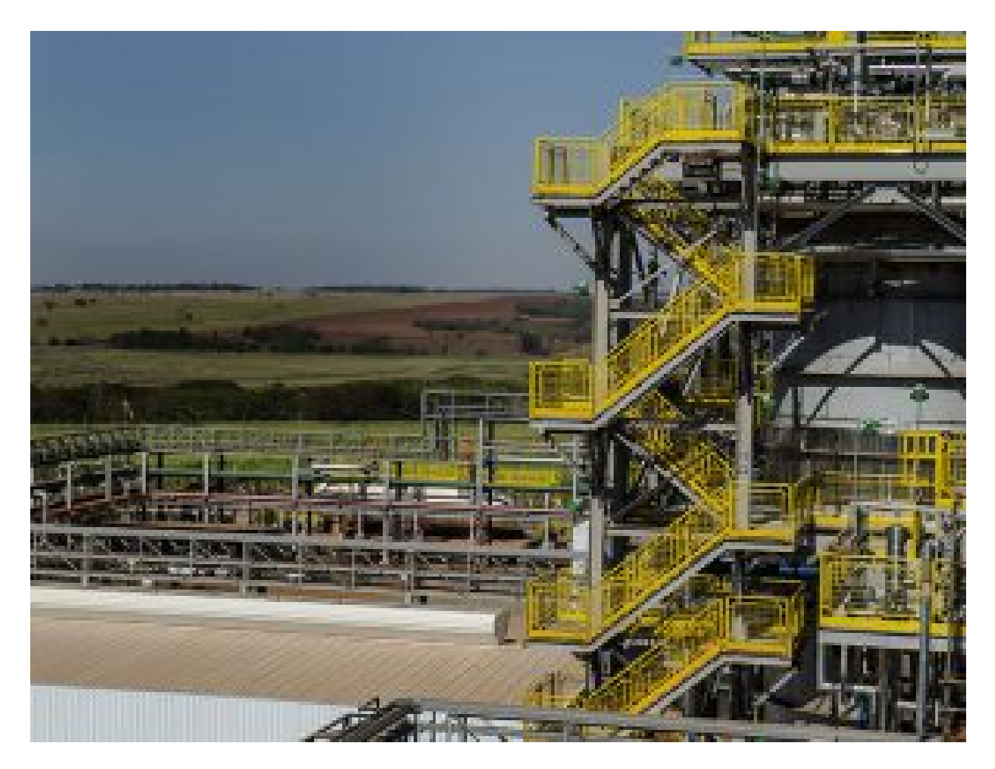
Terra Via microalgae are produced at a sugarcane farm in Sao Paulo, Brazil, in some of the world's largest aerobic fermenters.