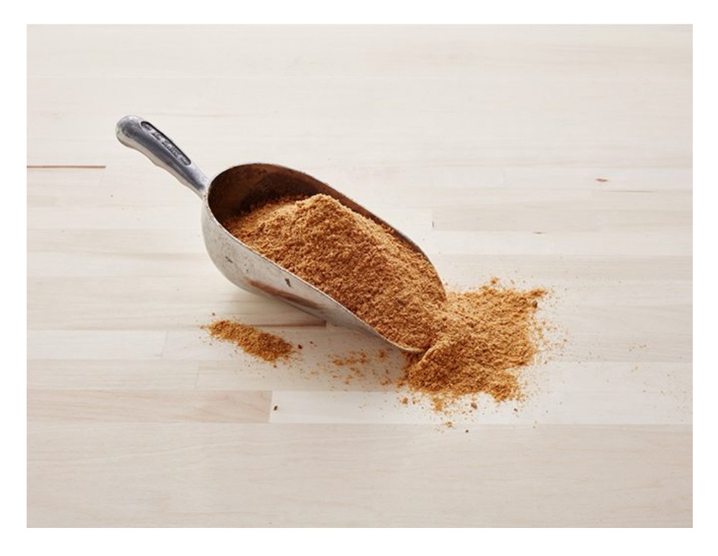
AlgaPrime™ DHA, which is said to offer nearly twice the omega-3 levels found in fish oil, launched early this year and secured its first customer BioMar, a major feed producer.

They are microscopic methane-munchers, these teensy bacteria that turn methane into carbon dioxide, water and energy. And even omega-3 fatty acids, the primary hook upon which the nutritional benefits of seafood consumption hang.