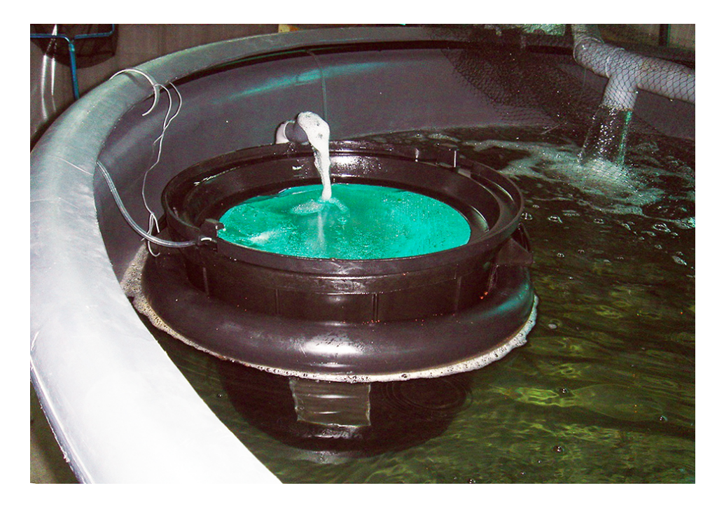
Shrimp postlarvae were reared in floating 80-liter buckets.

The New Caledonian shrimp industry is based on the culture of Pacific blue shrimp (Litopenaeus stylirostris). This nonendemic species was first introduced from Panama and Mexico in 1978. In 2002, a study demonstrated the dramatic loss of alleles resulting from the domestication process of the different stocks available in the New Caledonia hatcheries when compared with wild stocks from Ecuador. The shrimp producers decided then that new genetic variability was a good option.