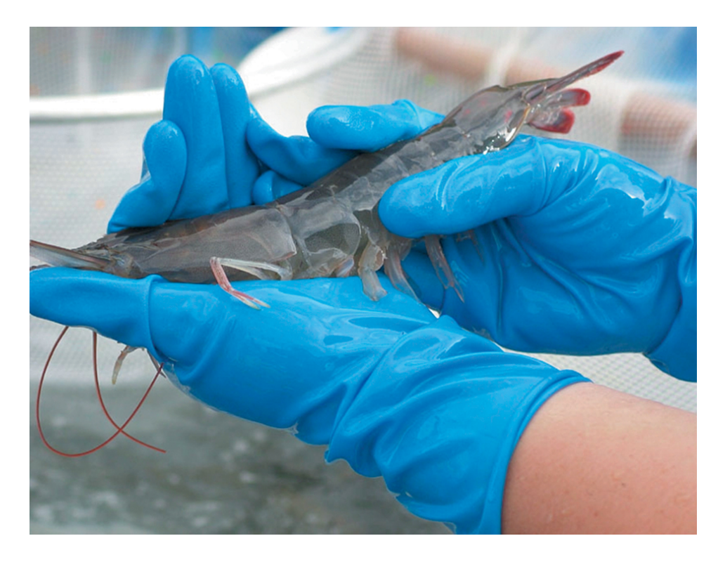
Biosecurity is essential to realize the full genetic potential of selectively bred SPF stocks, such as this broodstock shrimp from Oceanic Institute.

Over the past decade, trends in the global shrimp-farming industry include the use of specific pathogenfree (SPF) shrimp to mitigate crop loss from viral pathogens, which historically have caused significant declines in production and profitability for shrimp farmers worldwide. This is especially true for SPF stocks of Pacific white shrimp (Litopenaeus vannamei), which since their introduction to Asia in the late 1990s have resulted in a dramatic increase of global shrimp production over the past several years.