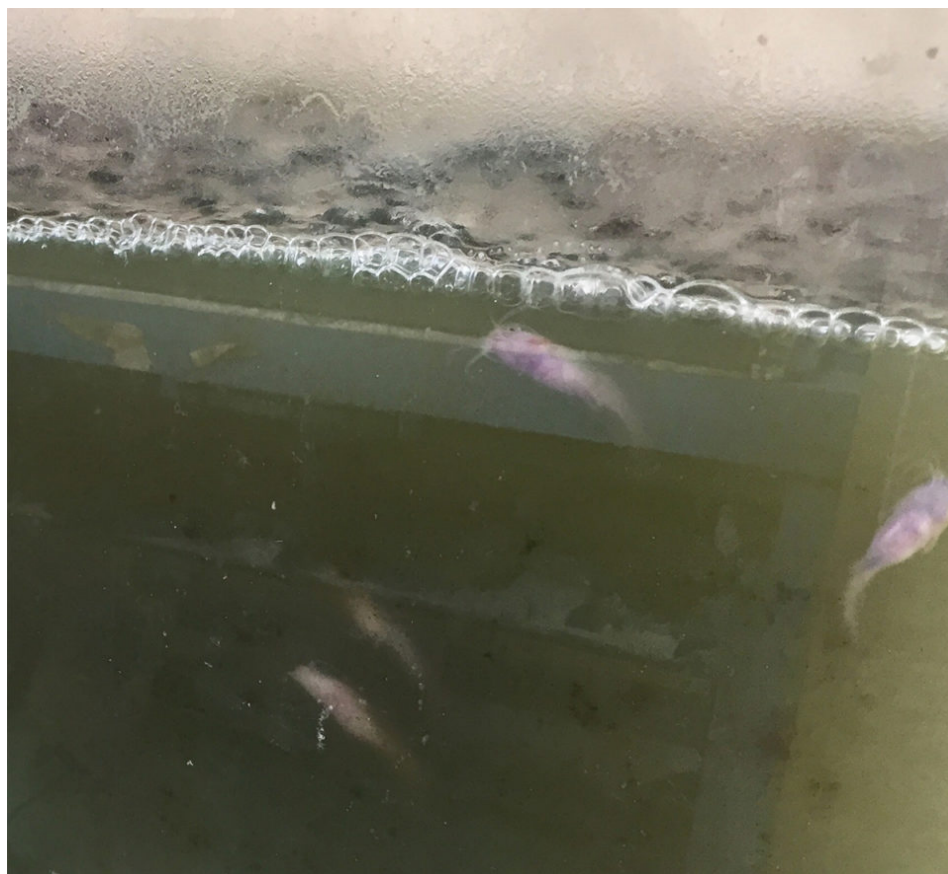
African catfish juveniles actively swimming in an outdoor biofloc-based system at Universiti Putra Malaysia.

Biofloc technology is a water quality management strategy that requires adding a carbon source – such as sugars, glycerol or complex carbohydrates – that stimulates heterotrophic bacterial growth, which converts otherwise toxic nitrogenous waste into biomass.