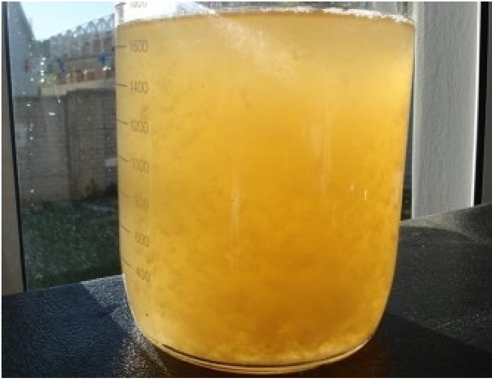
Biofloc in suspension (above) and biofloc settled after 10 minutes (below).

Flocs contain 98.5 percent water and so this presents a problem for fish that continually graze on them to meet not only metabolic requirements, but energy for good growth, which in turn necessitates an additional feed input. Tilapia consume about 1.5 g of protein from floc per kg of fish, which amounts to about 25 percent of their protein requirement. Research studies on floc systems have shown lower protein feeds of 24 percent provide similar growth of tilapia compared to 35 percent protein feeds, indicating the contribution of protein in biofloc consumed by fish. Feed typically accounts for 40-50 percent or more