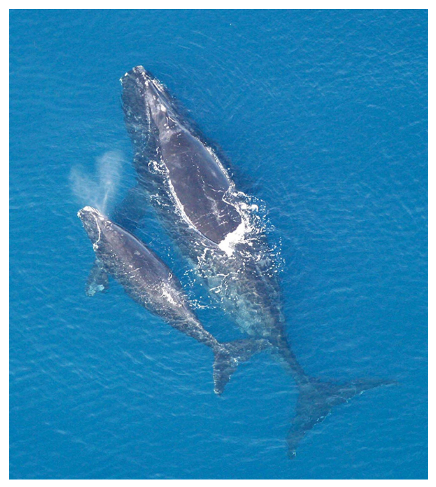
Concerns over North Atlantic right whale (Eubalaena glacialis) populations date back more than a century. Today, there are only an estimated 340 left in the world. Photo of North Atlantic right whale with calf.