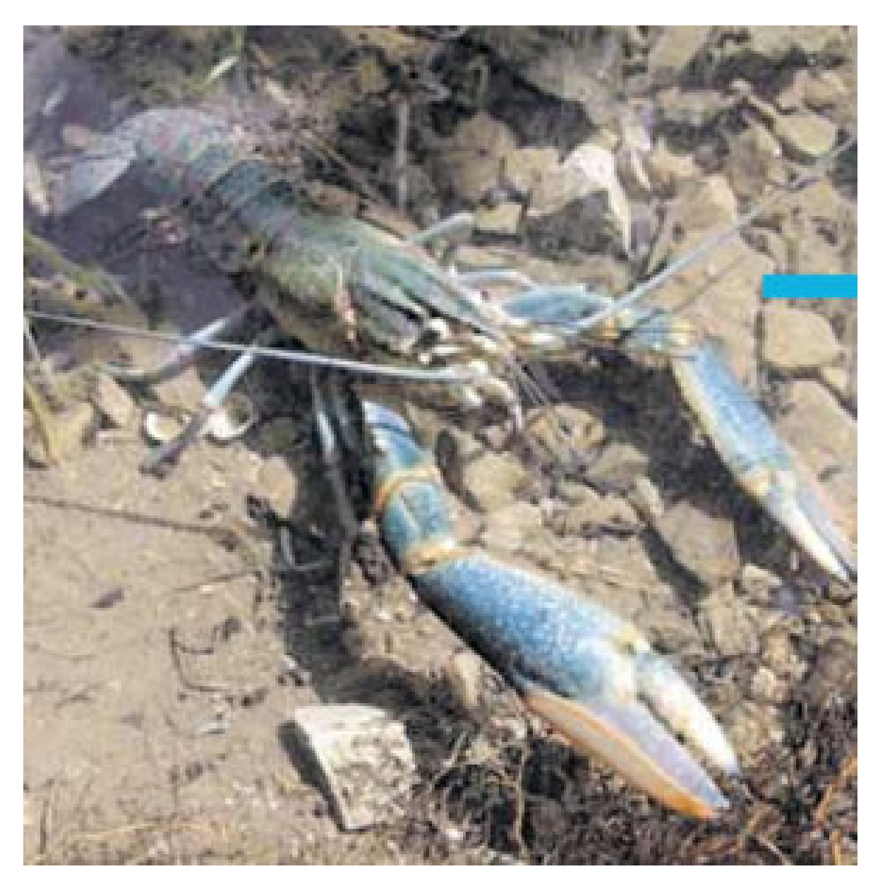
Male red claws are larger than females, but have proportionately less shell-on tail weight.