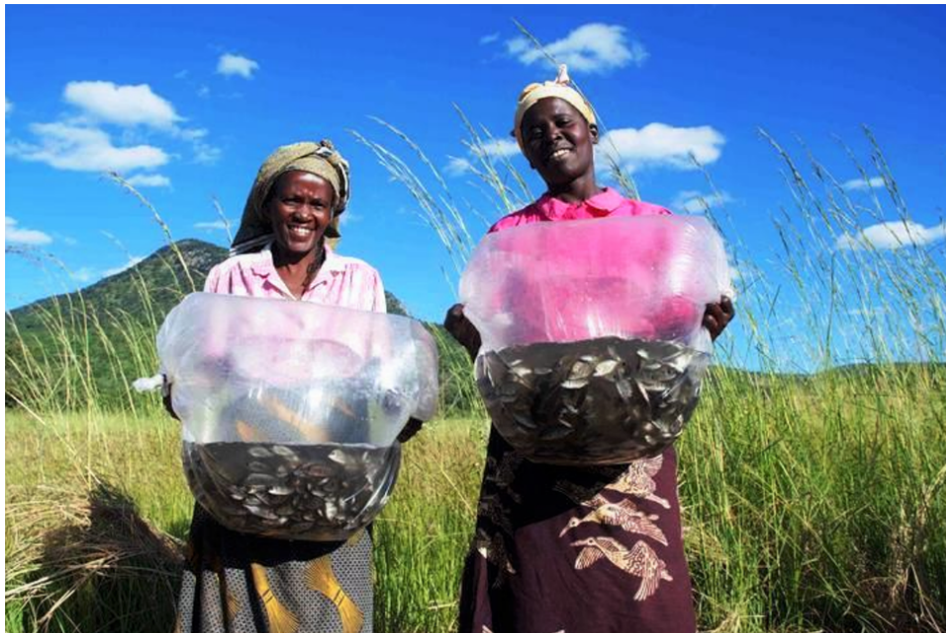
Zambian women hold bags of tilapia fingerlings.

These results show that there is potential to sustain capture fisheries and expand aquaculture to meet the growing demand for fish in Africa. This requires a sound, enabling macro-environment, particularly moderate to high-economic growth, to stimulate fish demand increase and sustained investment from farmers, investors and governments to transform Africa's capture fisheries and aquaculture into sustainable, productive, nutrition-sensitive and inclusive aquatic food systems.