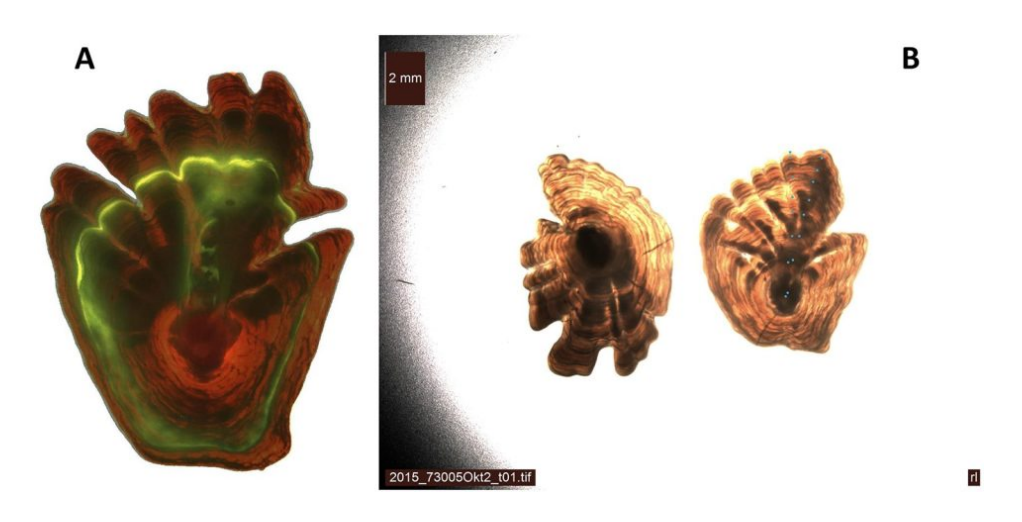
Fig. 1: Greenland halibut otoliths. A: An example of a Greenland halibut otolith, where the otolith growth is revealed when recatching a fish that has previously been injected with a substance to improve otolith fluorescence. B: Otoliths develop annual zones as the fish grows older. Backlight through the translucent Greenland halibut otolith reveals the otolith annual zones, which are counted to determine the age from the right otolith (two "parallel" dot series by two different readers). Adapted from the original.

<u>(https://doi.org/10.1371/journal.pone.0277244)</u> (Martinsen, I. et al. 2022. Age prediction by deep learning applied to Greenland halibut ( Reinhardtius hippoglossoides ) otolith images. PLoS ONE 17(11): e0277244) – reports on a study to analyze the performance of a CNN in predicting fish ages from 4,243 Greenland halibut images from a publicly available database and provided by the Institute of Marine Research with read ages (labels) provided by experts. For detailed information on the materials and methods used, refer to the original publication.