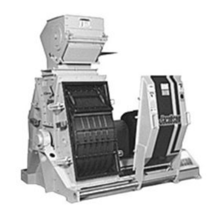
Fig. 2: Hammermill.

To achieve smaller particles would require a grinding circuit with sifters in between, to recycle coarser particles back to the hammermill for further grinding. This can be an inefficient process, particularly with