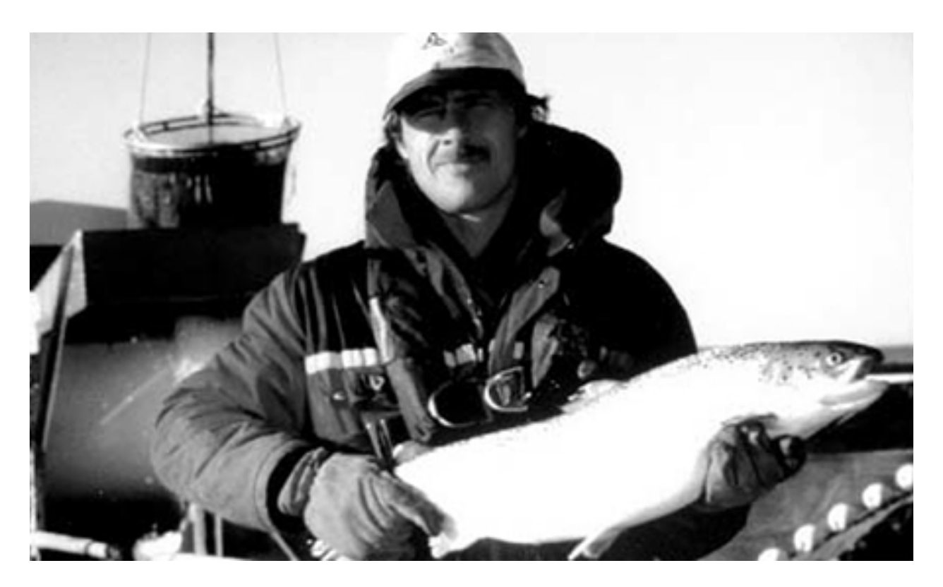
Genetic selection of salmon has improved growth rates by 80 to 100 percent in six generations.