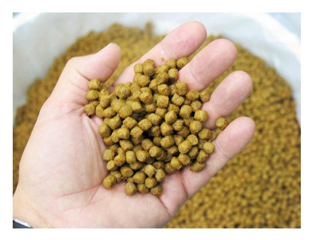
The newly released Alltech Global Feed Survey shows that the aquafeeds sector grew by 4 percent last year.

Alltech has just released its eighth annual Global Feed Survey (https://www.alltech.com/feed-survey), a compilation of estimated feed production data for this past year. It covers all regions, representing 140 countries and nearly 30,000 feed mills. As aquaculture is recognized as the fastest growing foodproducing segment, it makes sense that this year, Alltech's survey saw a growth of 4 percent in global feed production for this sector.