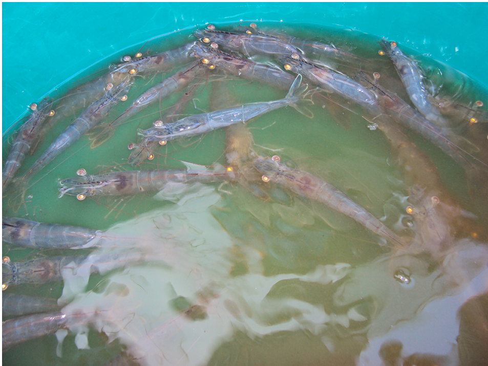
An NH 3 -N concentration of 0.45 mg/L reduced the growth of five species of penaeid shrimp by about 50 percent.

Ammonia nitrogen consisting of un-ionized ammonia (NH 3 ) and ammonium ion (NH 4 + ) occurs in waters of aquaculture production systems as a waste product of protein metabolism by aquatic animals and degradation of organic matter by bacteria and other microorganisms. Ammonia nitrogen also reaches ponds in nitrogen fertilizers such as ammonium sulfate, ammonium phosphate and urea that hydrolyze to produce ammonia nitrogen.