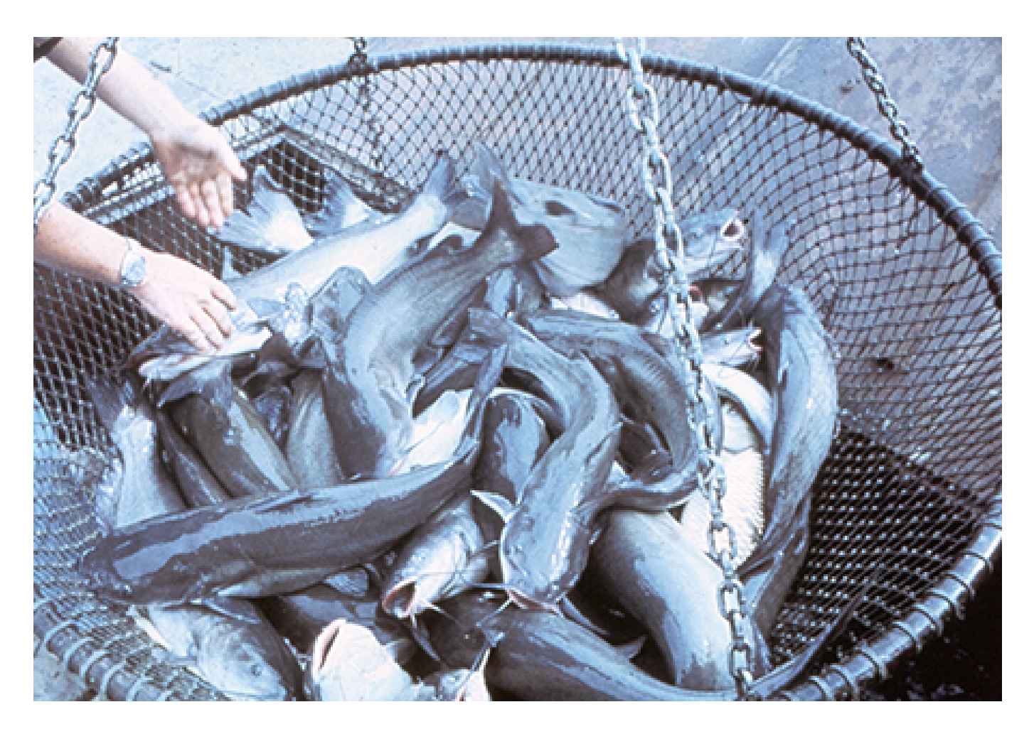
Reducing the protein content of catfish feed to the minimum needed to promote acceptable growth can decrease production cost and improve water quality.