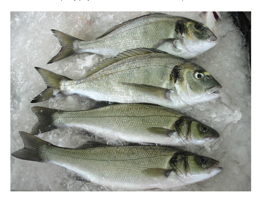
Under laboratory conditions, cultured sea bream fed finishing diets produced pigmentation patterns similar to wild sea bream.

The Optimized Aquaculture Product Quality Through Feed Quality and Feed Management (AQUALITY) project was designed to help European marine fish producers improve their competitiveness in the market during a period in which prices for sea bream (Sparus aurata) dropped drastically, affecting the competitiveness of relatively small producers. Funded by the European Commission, the project had two objectives to help small and medium-size enterprises improve their production and marketing strategies: